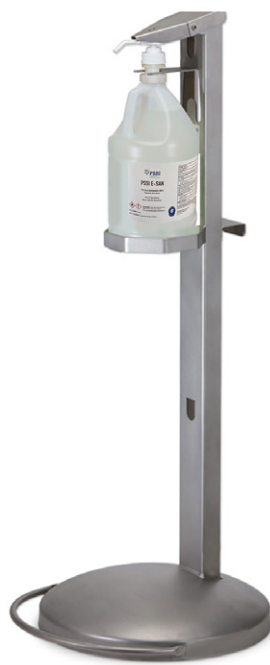
EZ Step SS Foot Activated