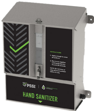
Electric Hand Sanitizer