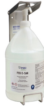
1-2 Knockout wrist activated dispenser